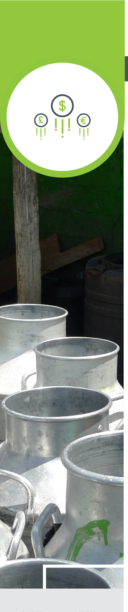
StARCK+ supported 15,000 farmers in Kenya to adopt climatesmart agricultural practices