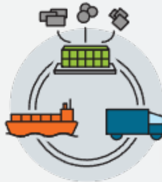
Procurement and supply chain