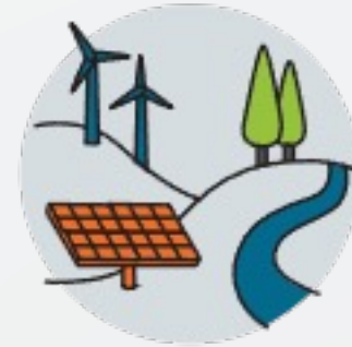
Sustainability and ESG