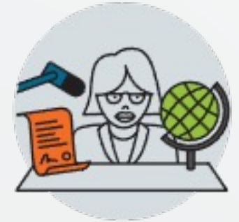
Corporate communications and external affairs