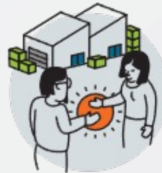
Community engagement and development