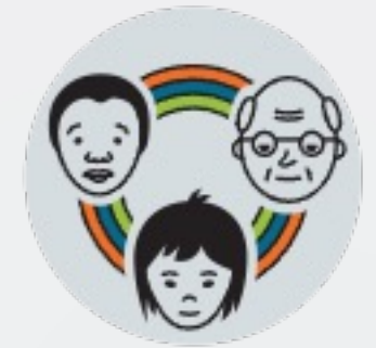
Diversity equity and inclusion