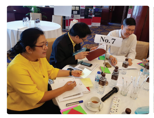
OH-APP WORKSHOP IN THAILAND IN OCTOBER 2018