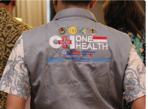
ONE HEALTH DAY CELEBRATION VEST IN INDONESIA