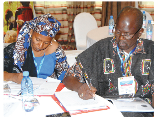
ONE HEALTH STRATEGIC PLAN VALIDATION WORKSHOP IN MALI JULY 2018